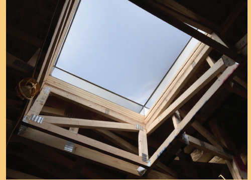
Providing a sanctuary for Christian Science healing – building progress inside and out!