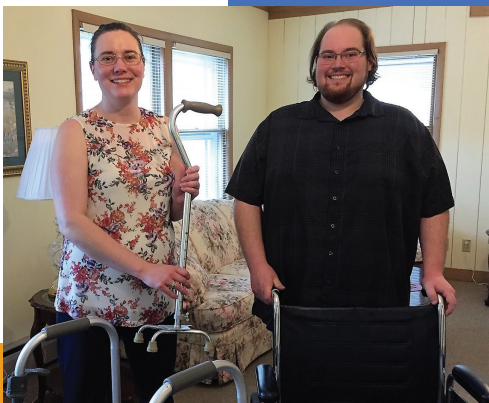
Mobility aids available for loan or to keep. As we prepare to move to our new building, we are giving away extra equipment. Churches may find it helpful to have wheelchairs or walkers on hand for the temporary use of your members. Please contact dirofdevelop@clearviewhome.org