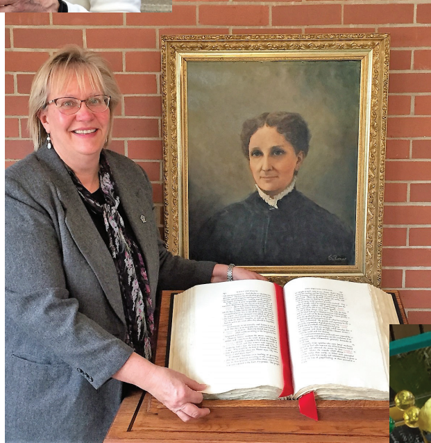
Grateful to own a rare, limited subscription edition of Science and Health with Key to the Scriptures by Mary Baker Eddy as a part of our library collection.