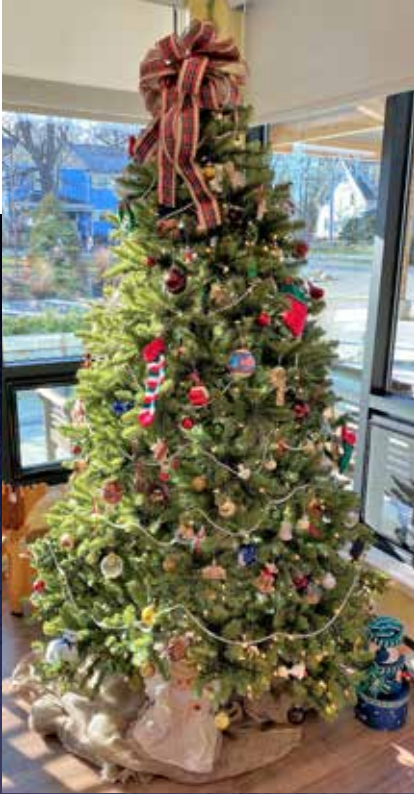
Christmas Tree delight!