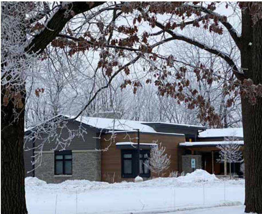
We are ready to serve in any season.

"Blessed be the Lord, who daily loadeth us with benefits, even the God of our salvation" (Psalms 68:19).