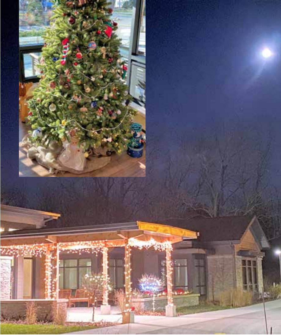
Christmas Lights (Holidays 2020)

Moved? Want to be on our mailing list? Please send changes to devassist@clearviewhome.org