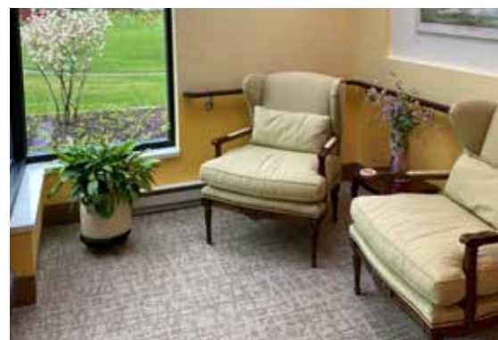
Our activity room, a friendly meal, and a cozy alcove.